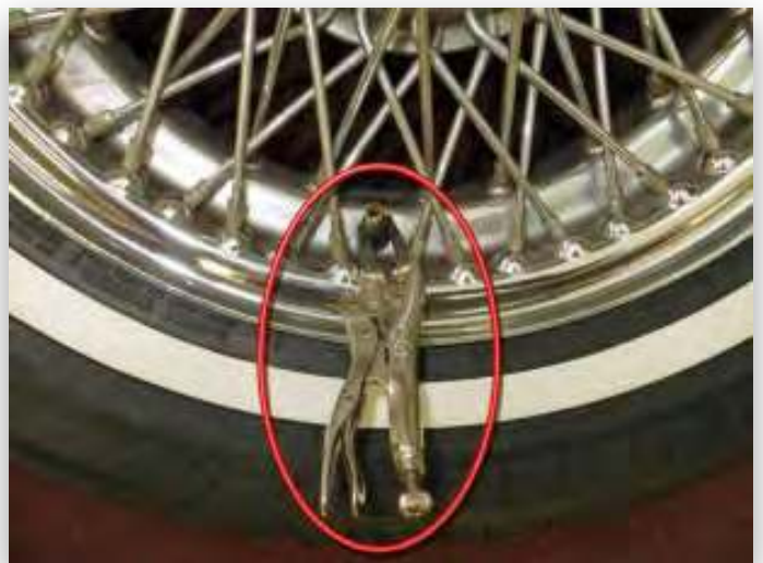
Grip the valve stem and remove the valve to prevent it from slipping inside the rim.