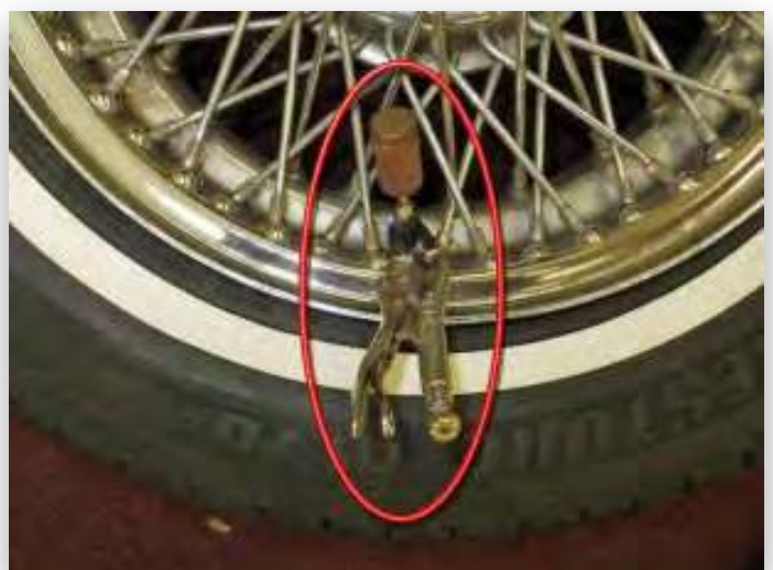
Remove the valve core to deflate the inner tube.