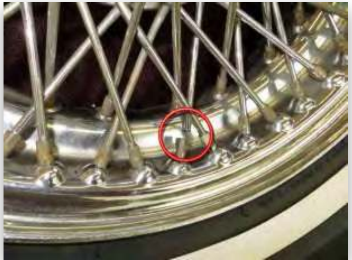
Spoke nipple broken off at the wheel rim.

Fortunately, replacing a broken spoke is fairly easy to do yourself if you cannot find a local