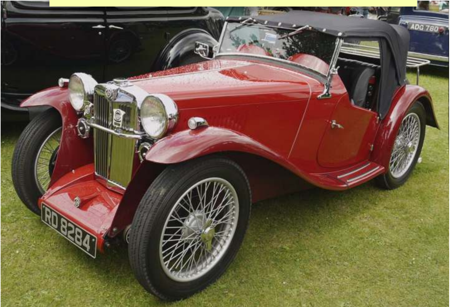
1936 MG PB